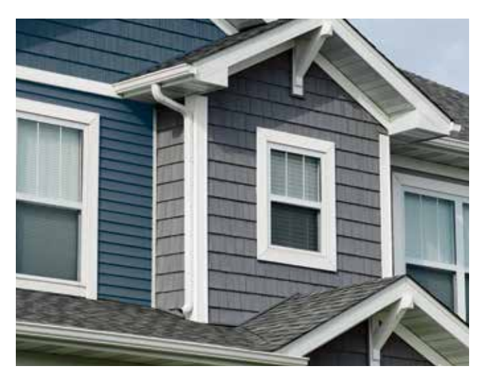
Heartwood™ PRO & Heartwood™

Wolverine® offers a complete line of vinyl products including soffit and accessories. Make your mark on any job by using accent products like Shingles or Board & Batten to add the perfect finishing touches.