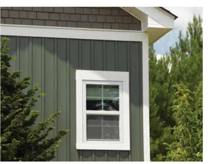
Board & Batten